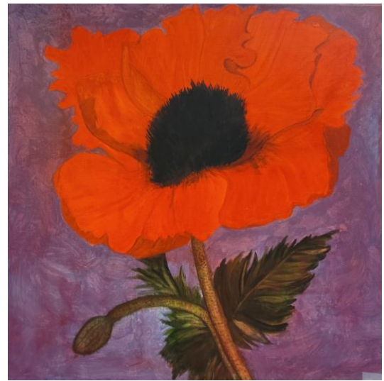
Peggy Tombro, "Poppy"